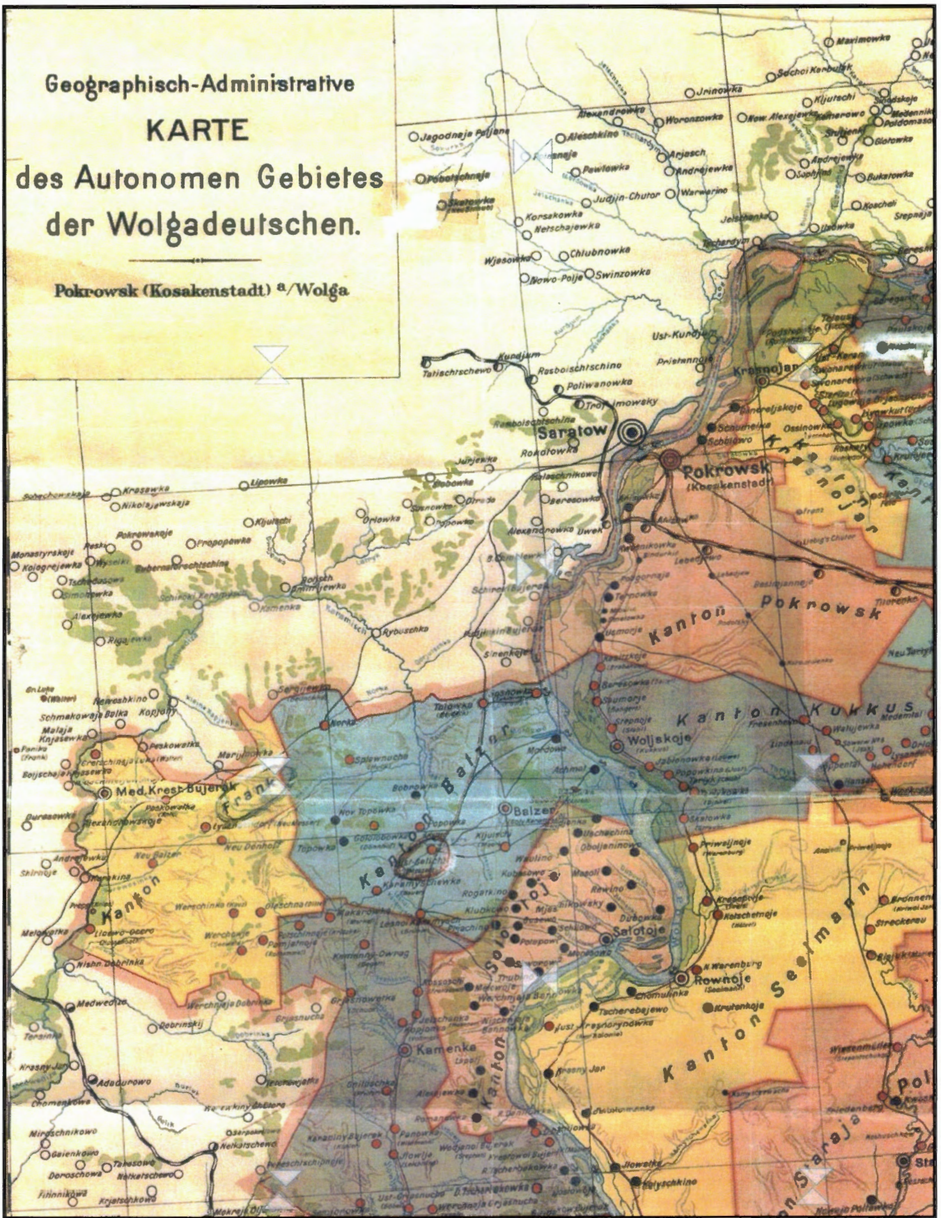
Rare map of the Autonomous Volga-German Republic in Russia (1920-1940). It is unknown why the circle is on the map.